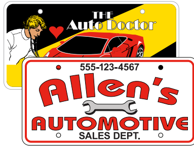
4880 .023" thick (round holes standard)