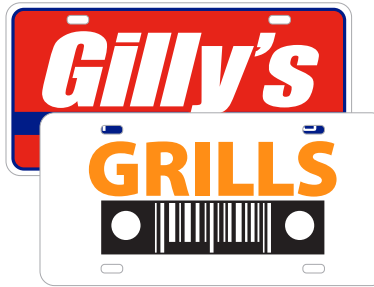
4883 .035" thick (oblong holes standard)