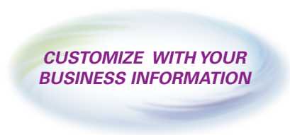
#842-NS-IMP (Form #ODOM-65-3) No Screen