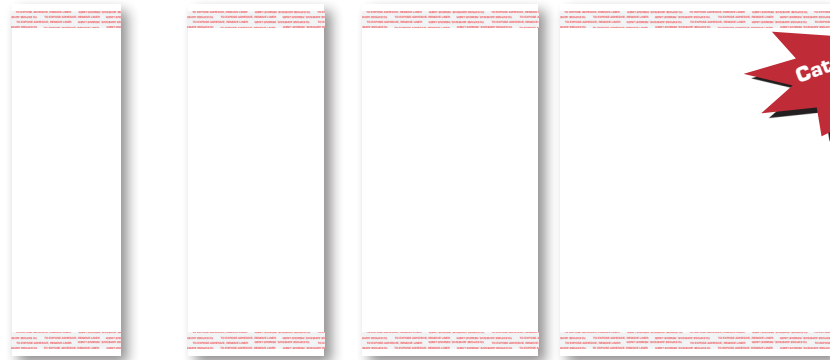
#8259-1 Up to 3.4" wide #8259-2 3.5" - 4.25" wide #8259-3 4.3" x 5.5" wide #8259-4 5.6" x 8.5" wide