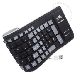
740-2 Rollable Water-Proof USB Keyboard