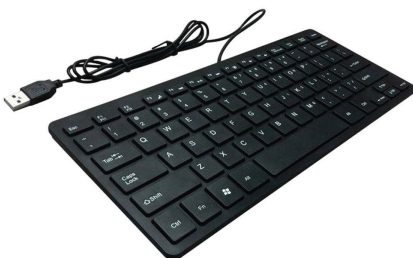
740-3 Rigid Water Resistant USB Keyboard