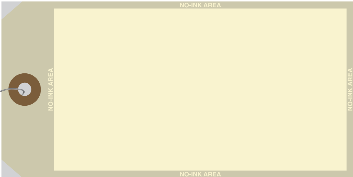
ITEM #628 - MANILA TAG - 6.25" x 3.125"