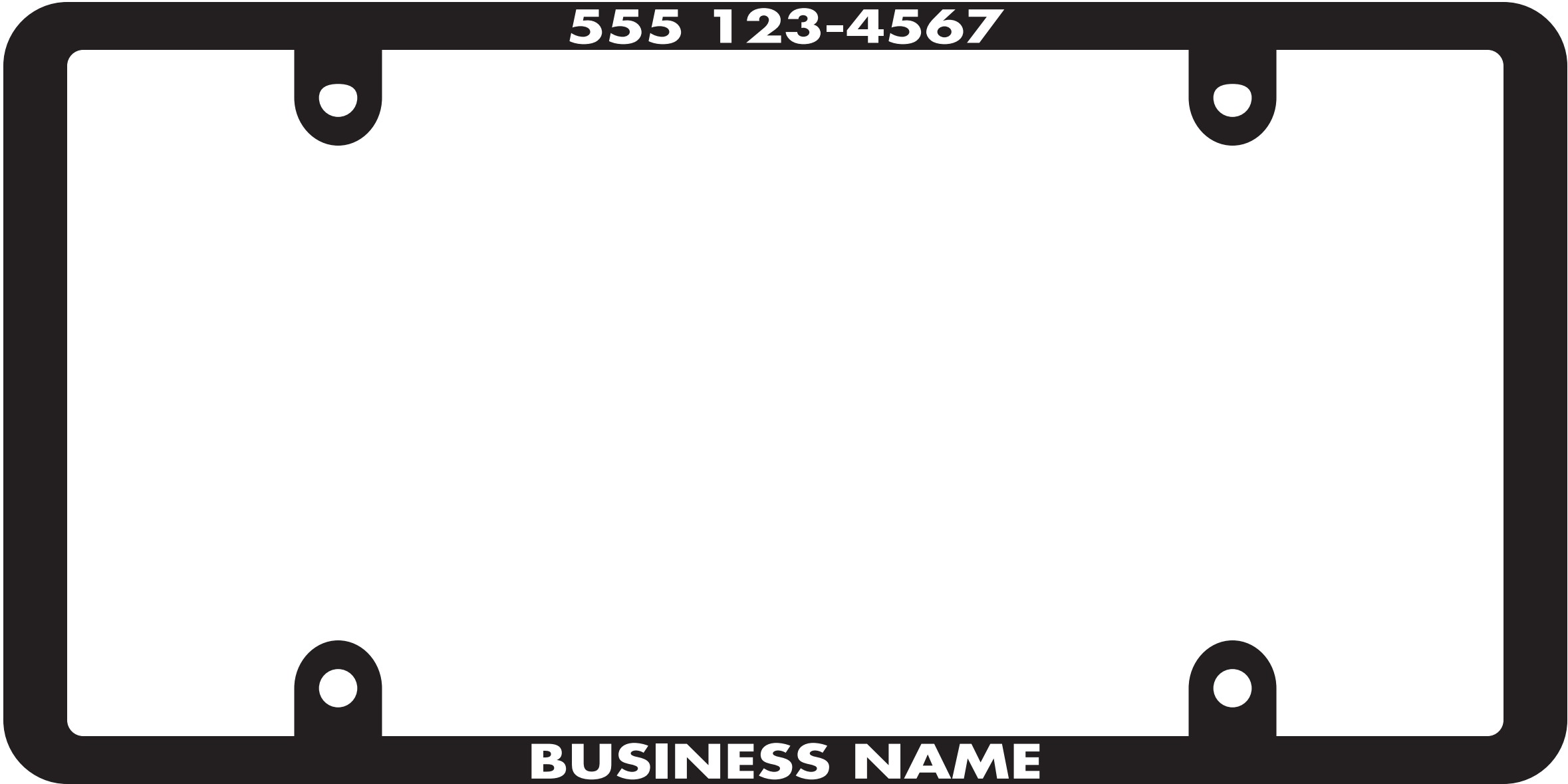
LICENSE PLATE FRAME - STYLE Q - 12.25" X 6.125"

RAISED LETTER FRAMES MUST HAVE 2 HOLES AT TOP