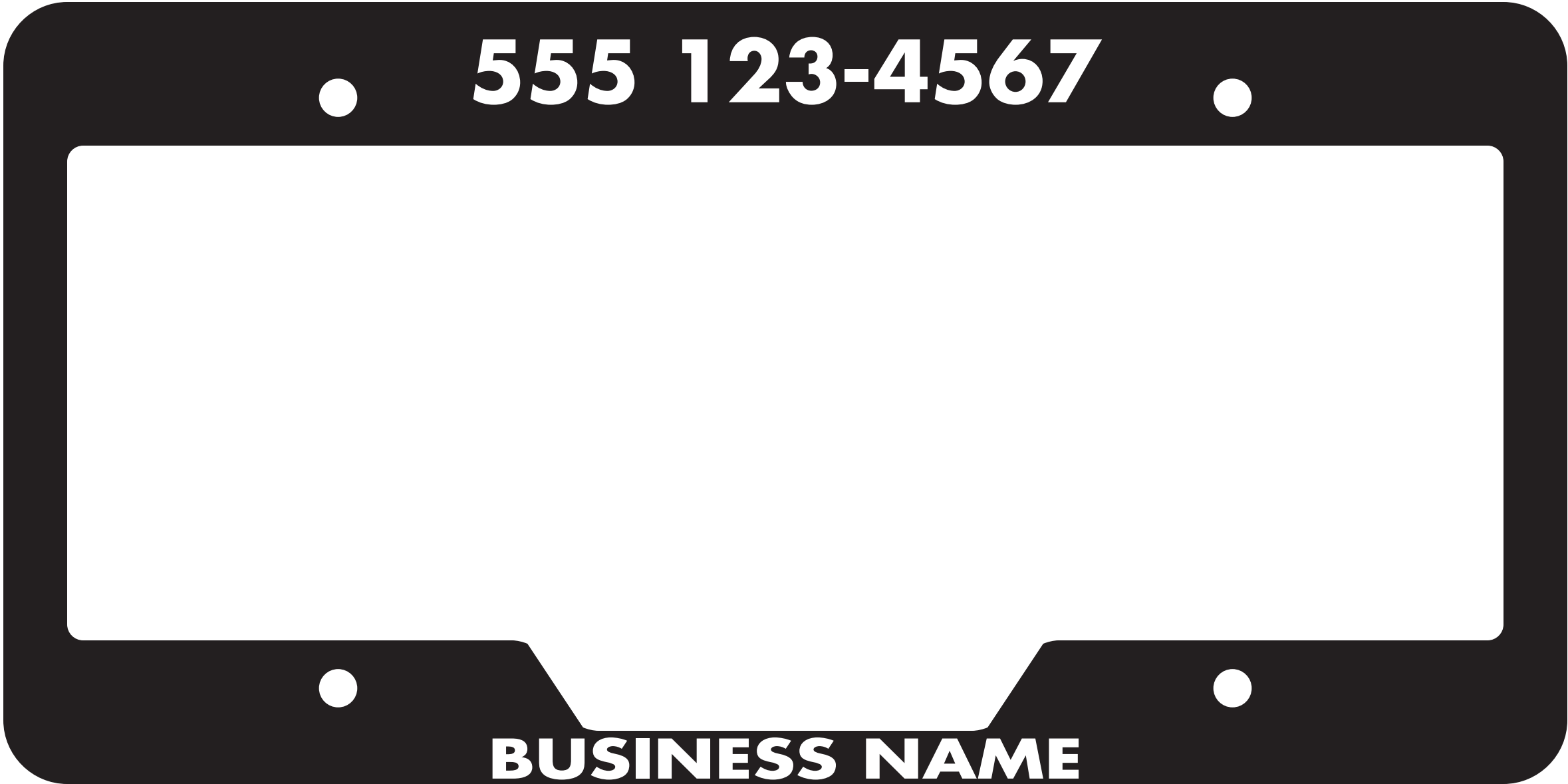
LICENSE PLATE FRAME - STYLE C - 12.25" X 6.125"

RAISED LETTER FRAMES MUST HAVE 2 HOLES AT TOP