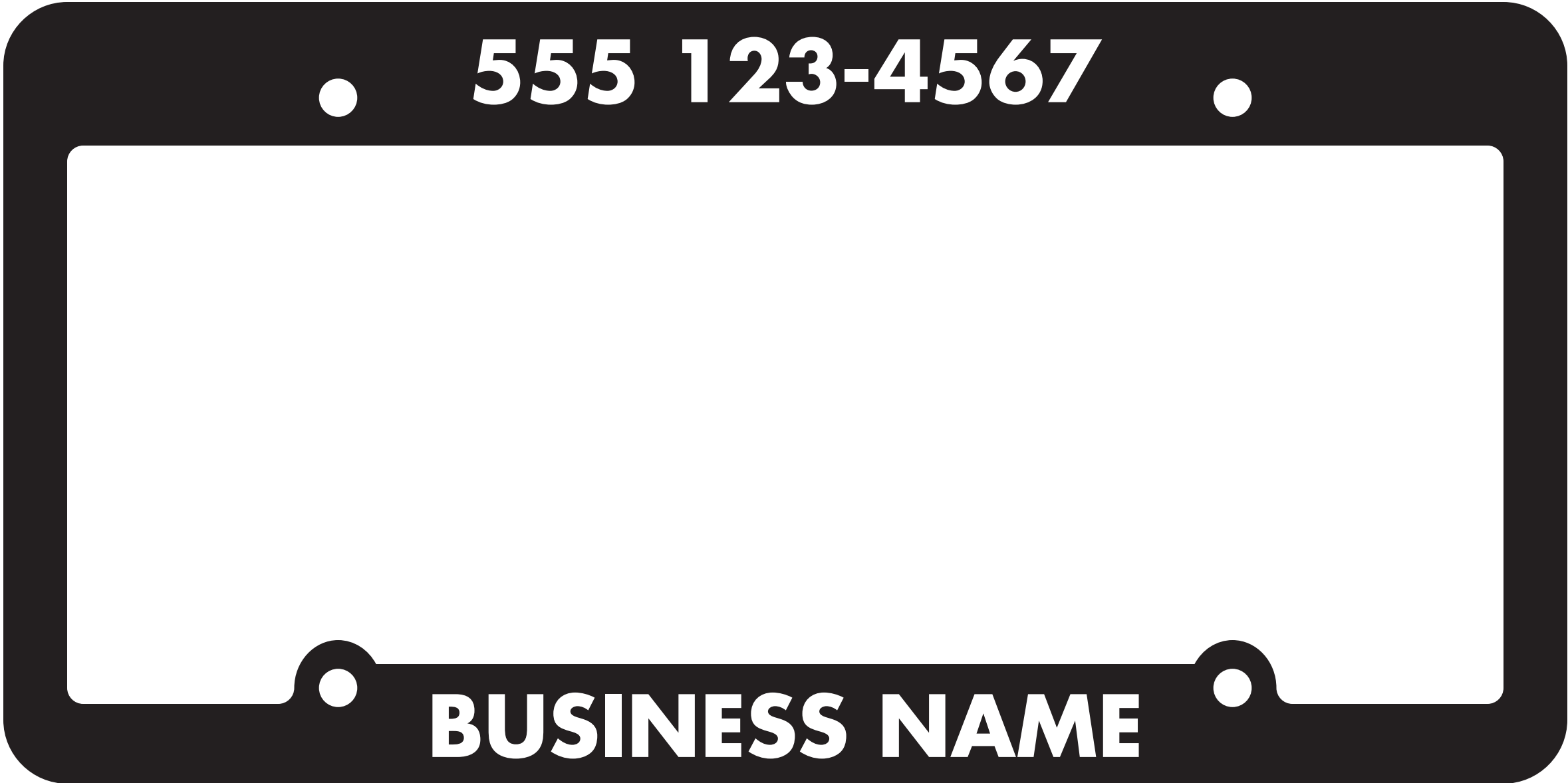
LICENSE PLATE FRAME - STYLE R - 12.25" X 6.125"

RAISED LETTER FRAMES MUST HAVE 2 HOLES AT TOP