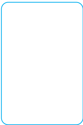
ITEM 1820 - 5in1 STATIC CLING - 2.25" x 1.5"