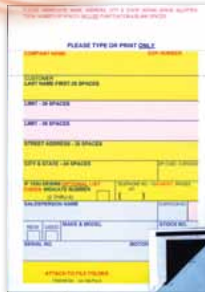
#8104 (Form #AA-168 P/A-3) Permanent Adhesive Version

NEW! Permanent Adhesive Label in 3 parts!