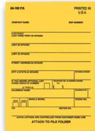
#8102 (Form #AA-168 P/A)