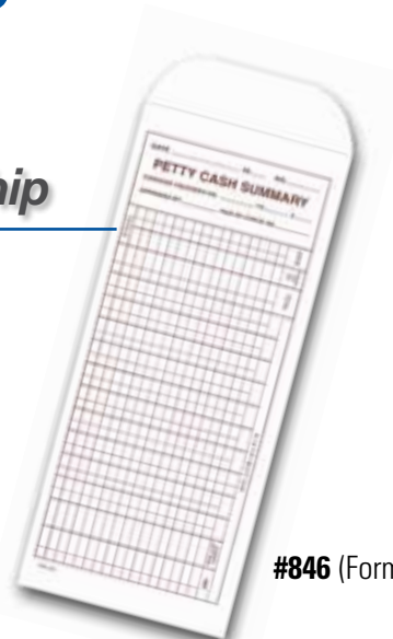
#846 (Form #DSA-230)

Quantity price breaks are: 1, 3, 5, 10, 20 packs