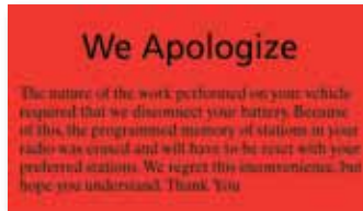
#711 (Form #RT-4)