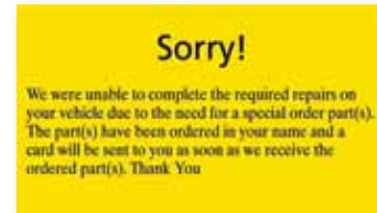
#712 (Form #RT-5)