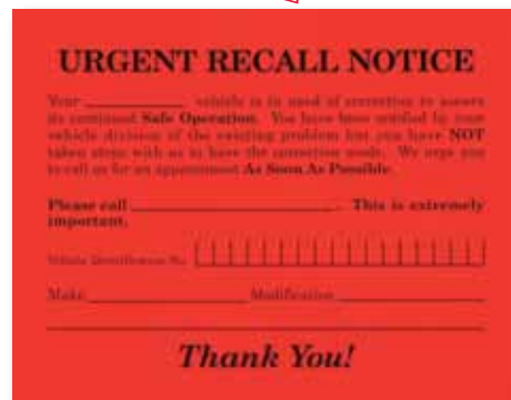
#726 (Stock) (Form #RT-6)